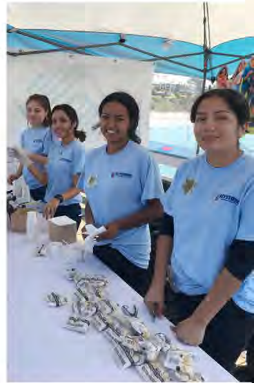
Keystone Club working for the Chowder Fest